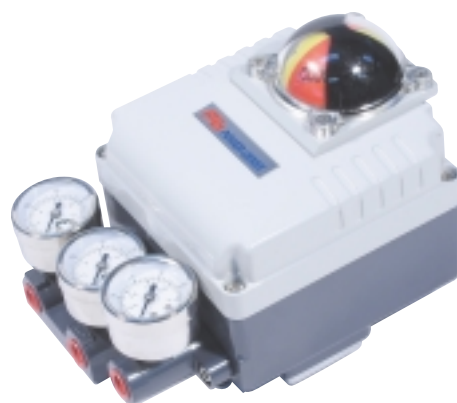
With Dome Indicator

Note : 1) 1/2 split range is available for 3-9 psi input signal or 9-15 psi input signal 2) Please contact for 6-30 psi input signal 3) Operating angle can be adjusted to 0~60° or 0~100°