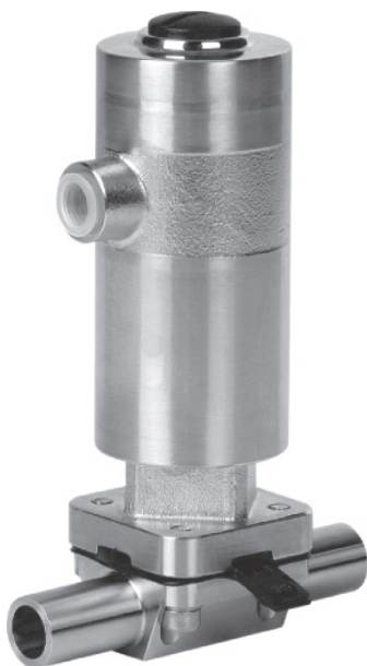
Cf. 4 & 5