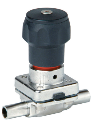
Butt weld ends MA 8 Fold out page 13